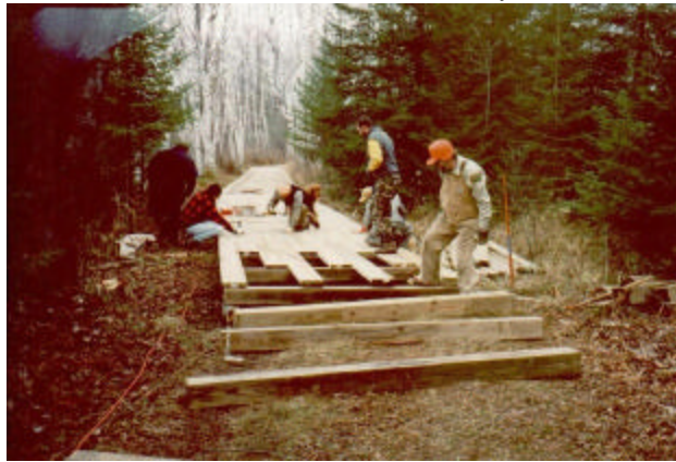
TBTA members feverishly pounded nails and fit boards for a new boardwalk at the Norway Ridge Pathway beaver pond.

This past fall has been busy for the Thunder Bay Trails Association. Several members of the TBTA along with MDNR and Boysville/Huron House kids spent several weekends at Norway Ridge Pathway repairing and fixing the trails. One weekend was spent trimming the trees and brush back from the trails, removing downed debris, painting trail markers on trees, and putting up new