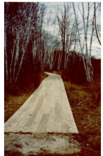
The completed boardwalk is 420 feet long and utilized 220 volunteer hours to build.

While the decking will be hard to notice now that winter is here,