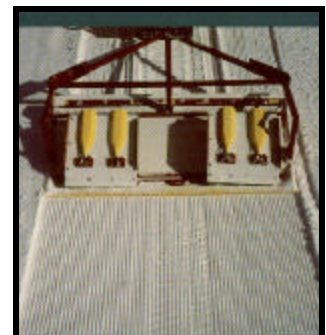
The TBTA purchased a cross-country ski groomer and snowmobile for the maintenance of area ski trails.